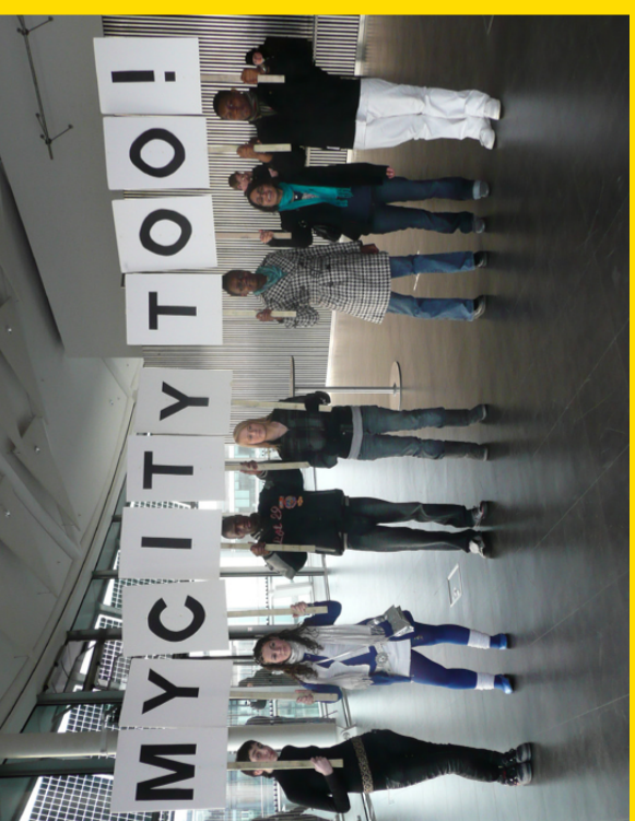
My City Too Ambassadors at City Hall, London

Our solution: Provide ramps and lifts in all public spaces so everyone can be part of the capital